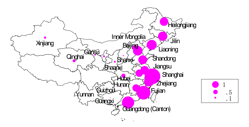
Figure 3. Provincial Distribution of Financial Deregulation (F-Reform, 1987-92)