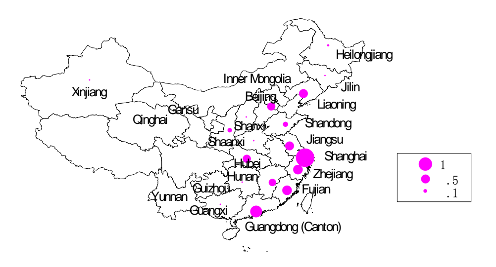
Figure 2. Provincial Distribution of Financial Deregulation (F-Reform, 1981-86)