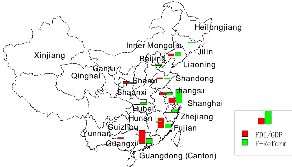
Figure 1. Provincial Variation in FDI and Financial Deregulation (1987-1992)